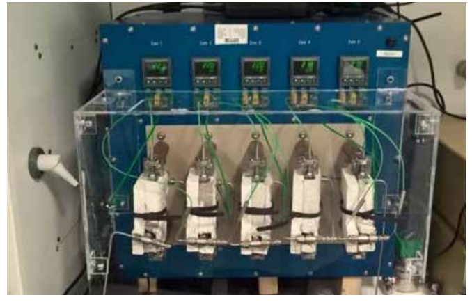
Figure 5: Image shows the Infineum 5-rod thermal deposition rig.

The gradual heating of the Infineum 5-rod thermal deposition rig more closely mimics the refinery heat exchanger bank compared to the single rod test.