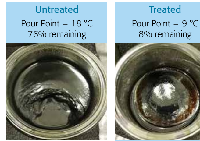
Oil soft and easy to clean

The wax settling test rig was miniaturized and validated so multiple samples can be tested simultaneously with less oil. This allows for a quick turnaround on additive screening in the crude oil of interest and faster more insightful recommendations to the customer.