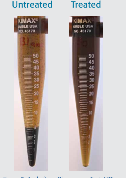
Figure 3: Asphaltene Dispersancy Test, ADT